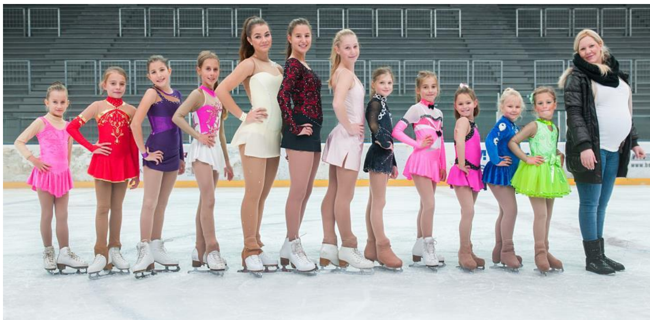
Skaters of the Skating Club Jesenice in December 2015.